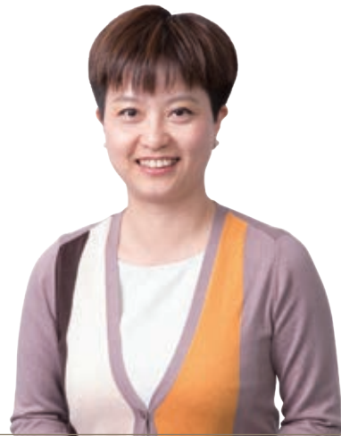
副主席Vice-chairman 陳肇始教授 Prof. Sophia CHAN Siu-chee